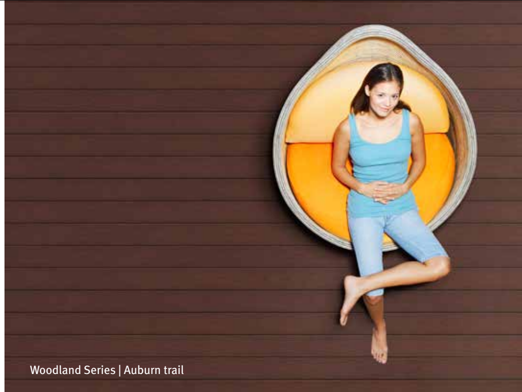
Woodland Series | Auburn trail

Actual products may differ slightly from photos shown due to minor color variances.