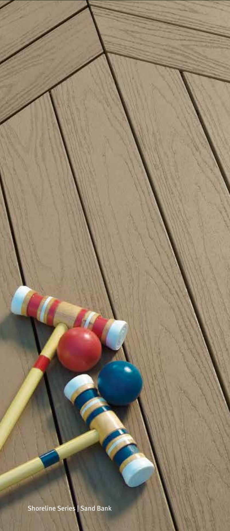
Shoreline Series | Sand Bank

Fused PVC Polymer Surface Technology & Neutral Colors Limited Lifetime Performance Warranty*