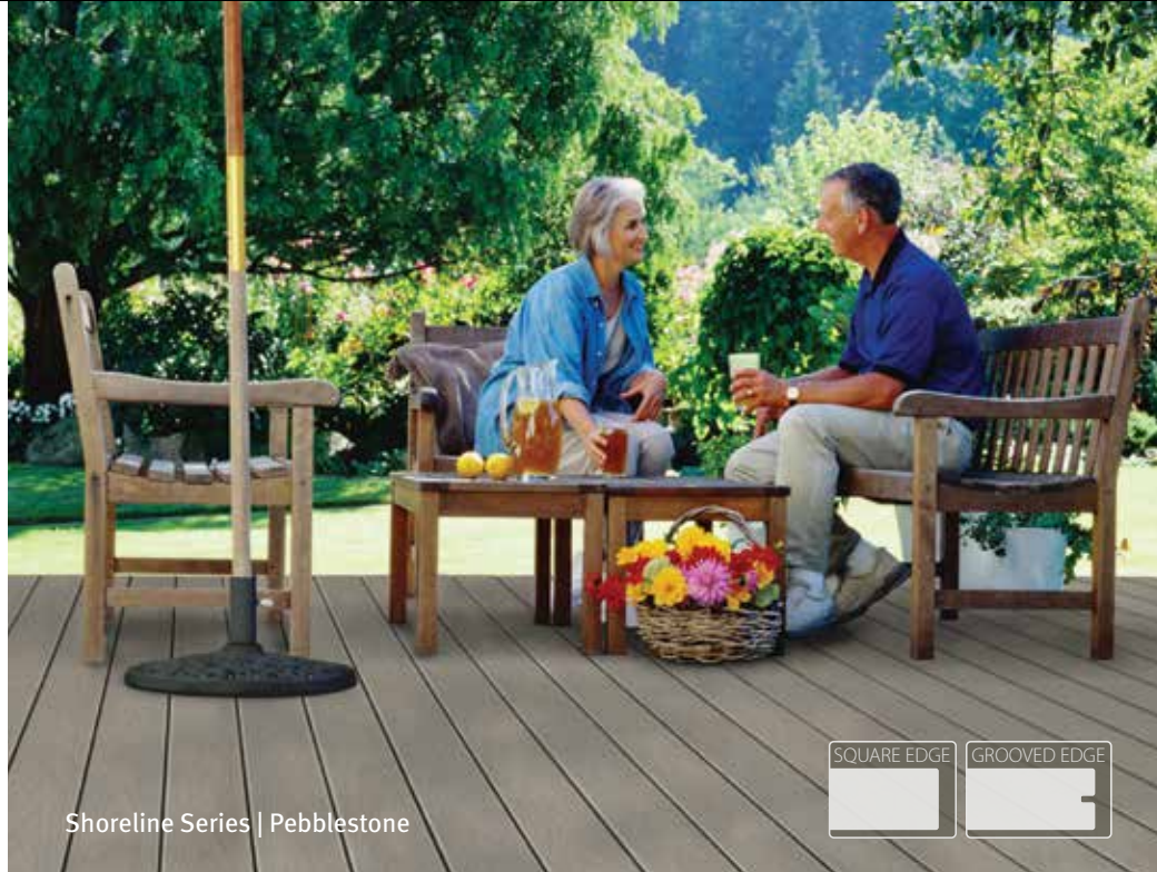
Shoreline Series | Pebblestone